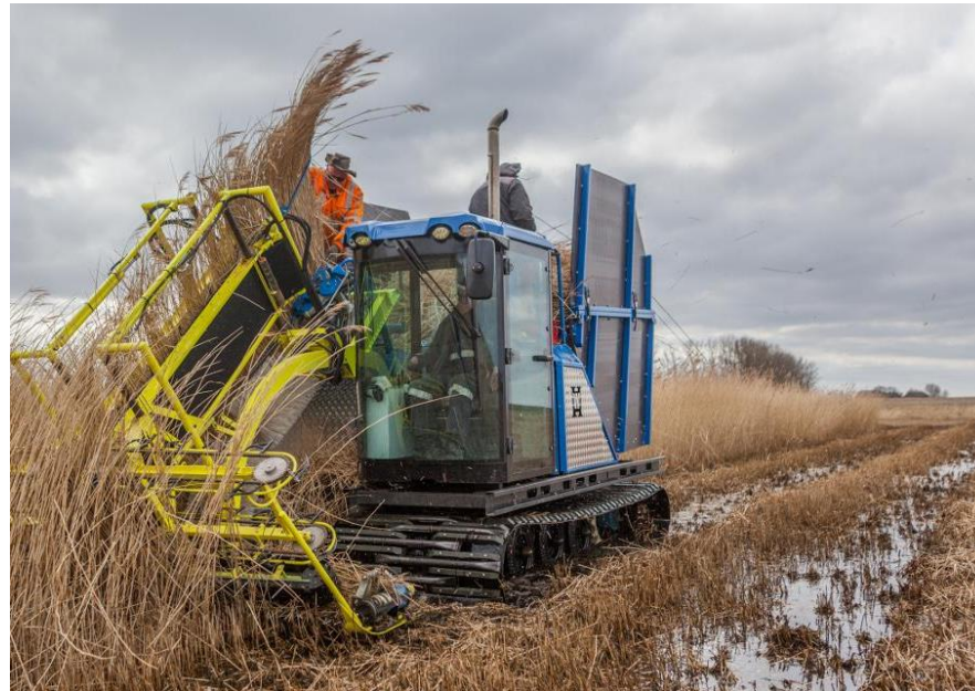
(Schilfernte bei Anklam, Mecklenburg-Vorpommern)